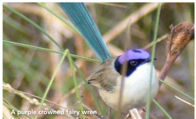
A purple crowned fairy wren