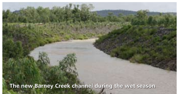
The new Barney Creek channel during the wet season

In all, 30 sites were sampled around the mine during the April survey and 565 fish were caught. Of those, 151 fish were tagged and three previously tagged fish were re-caught.