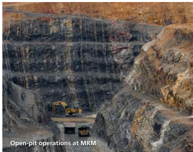
Open-pit operations at MRM

Along with work in the new pit stage, an associated capital project has commenced, with a water storage dam and a water management bund to be constructed to ensure water does not enter the working areas during the wet season.