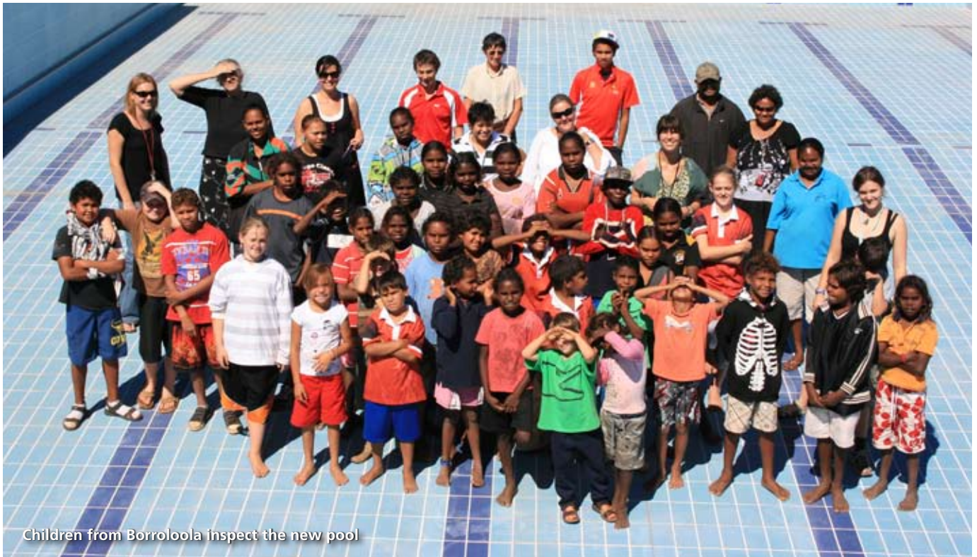
Children from Borroloola inspect the new pool

For the children of Borroloola, the anticipation is beginning to grow.