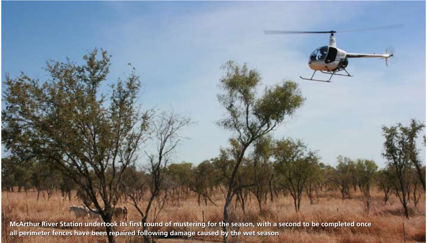
McArthur River Station undertook its first round of mustering for the season, with a second to be completed once all perimeter fences have been repaired following damage caused by the wet season

Minister Garrett's department has accepted these plans and requested some additional information about the mine's methodology for assessing data. MRM is currently providing this information.