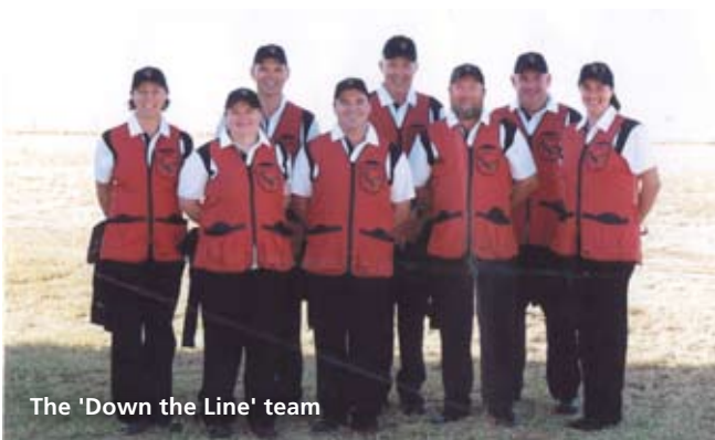
The 'Down the Line' team

The MRM sponsored 'Down the Line' team from the NT Clay Target Association, recently achieved one of its best results at the National Clay Target Championships held in Roma, Queensland.